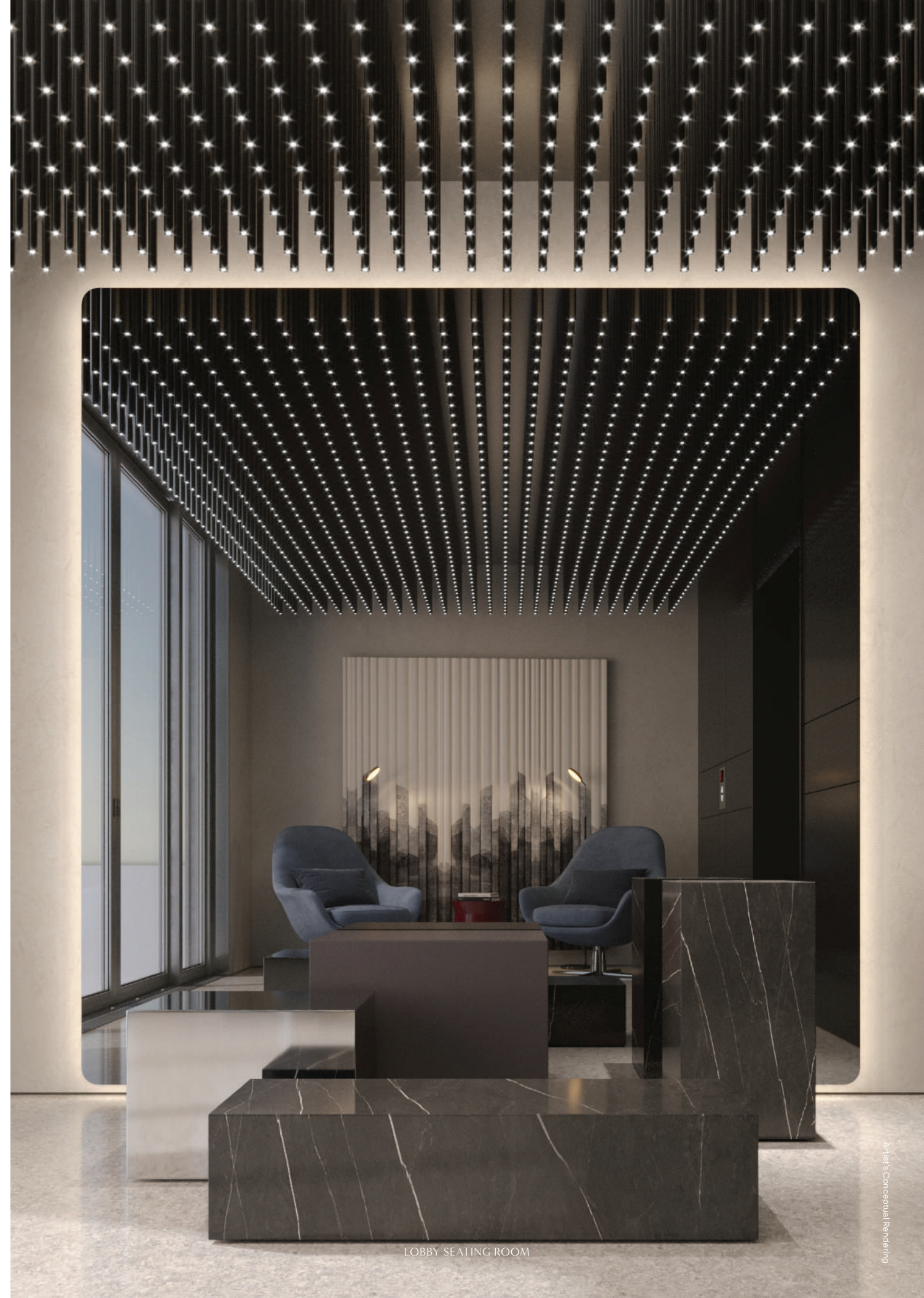
LOBBY SEATING ROOM

A++ is the internationally recognized brand through which ARCH GROUP communicates its work. The group is a multi-disciplinary organization made of different companies that target everything that affects HUMAN space: from product design to communication, from architecture to interiors, from development to procurement. They work in more than 10 countries around the world on different types of projects. Their strength and growth as a global firm provide one further important benefit: their vision is a creative process where ideas can flow freely through cultural barriers and gain from the commingling of diverse disciplines and techniques.