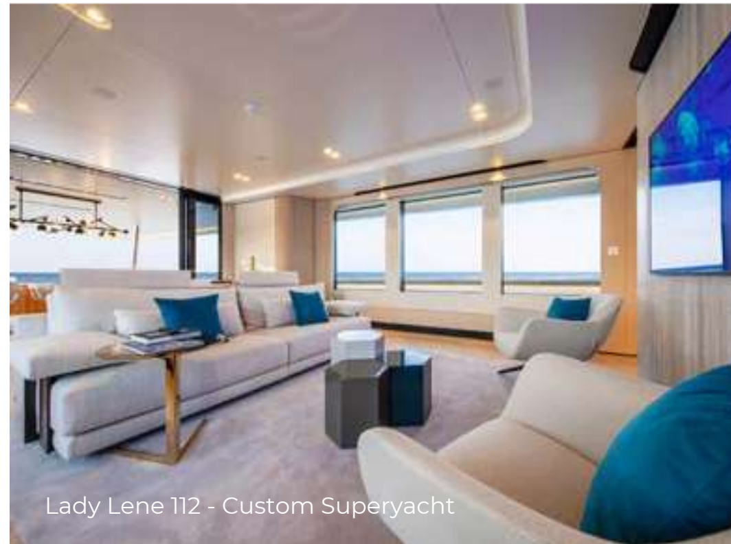
Lady Lene 112 - Custom Superyacht