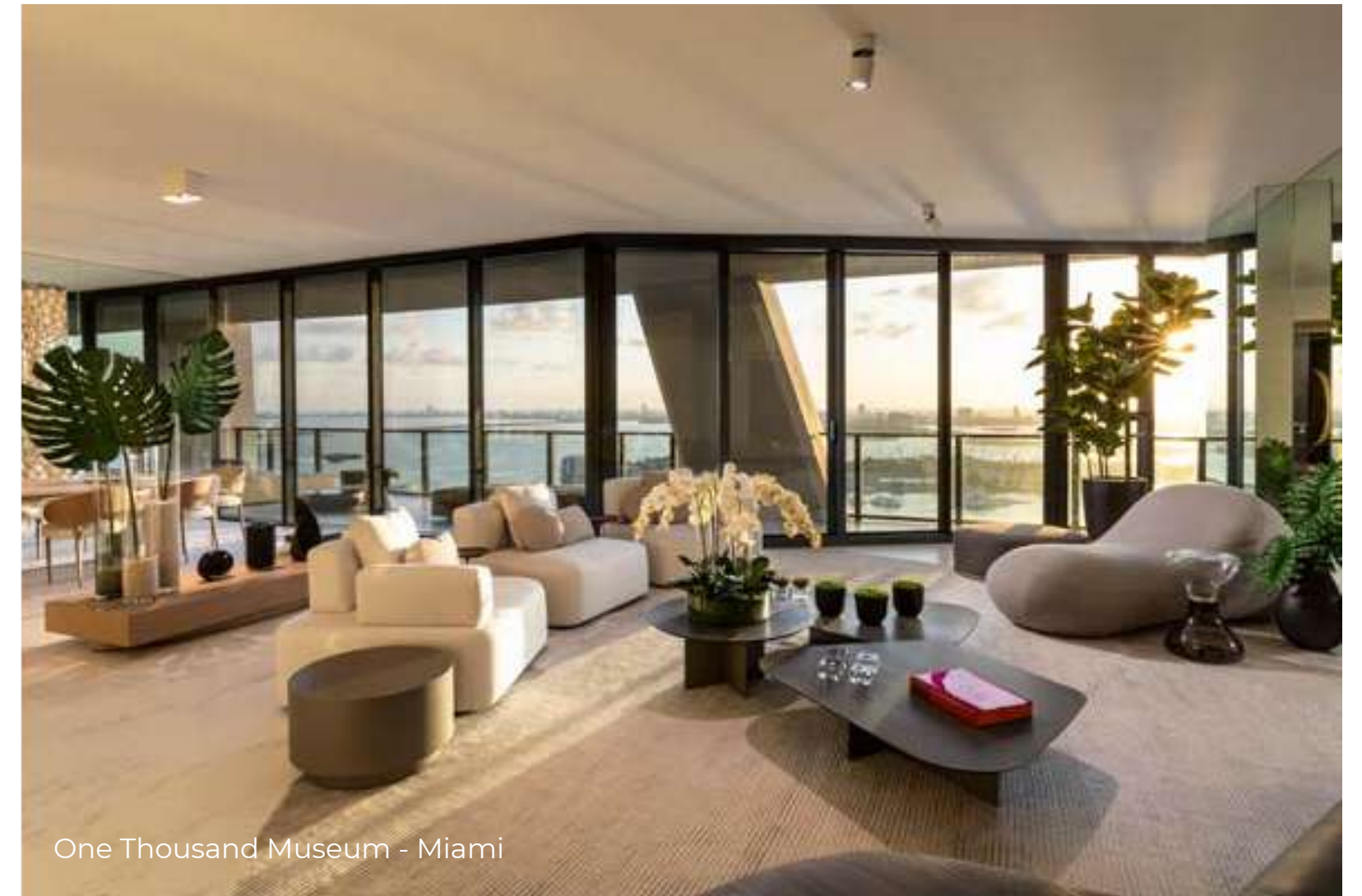
One Thousand Museum - Miami