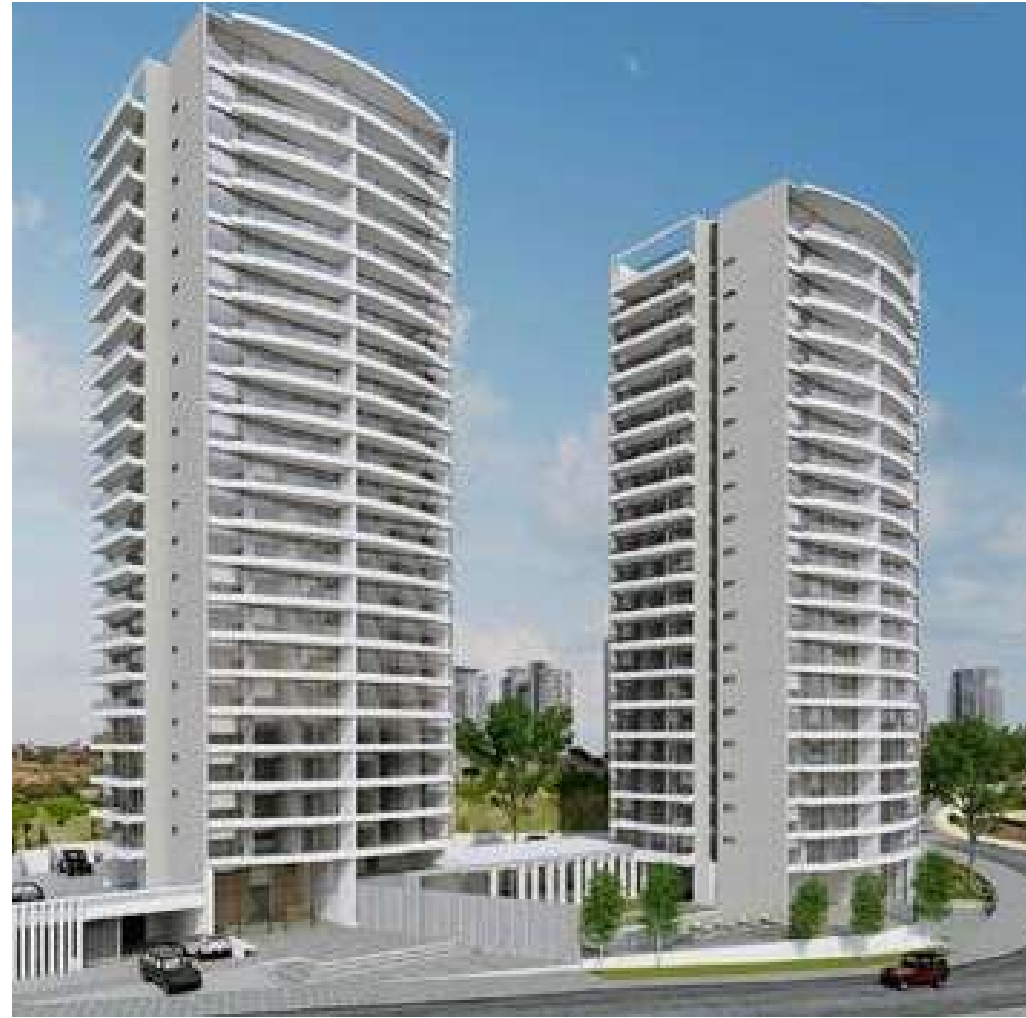
Edificio Almar Concón, V Región, Chile Departamentos