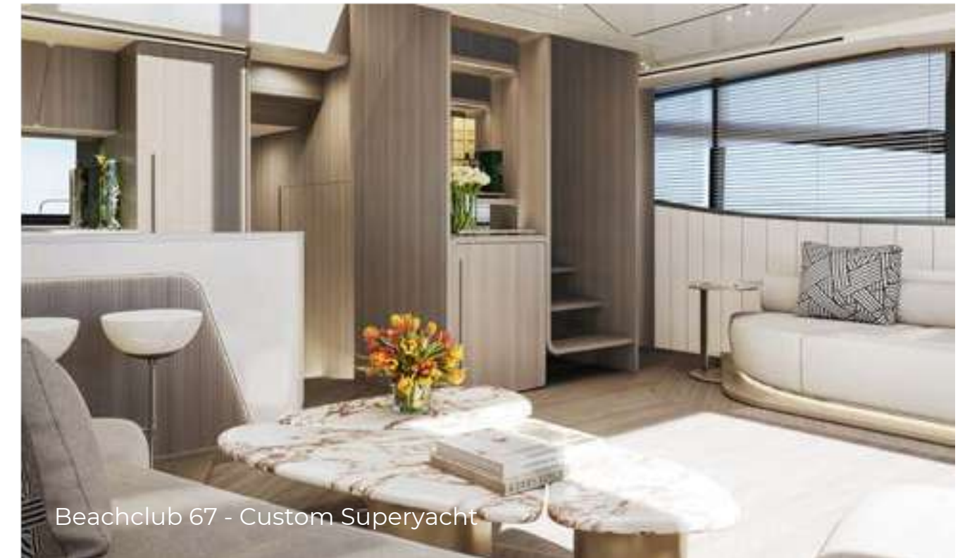
Beachclub 67 - Custom Superyacht