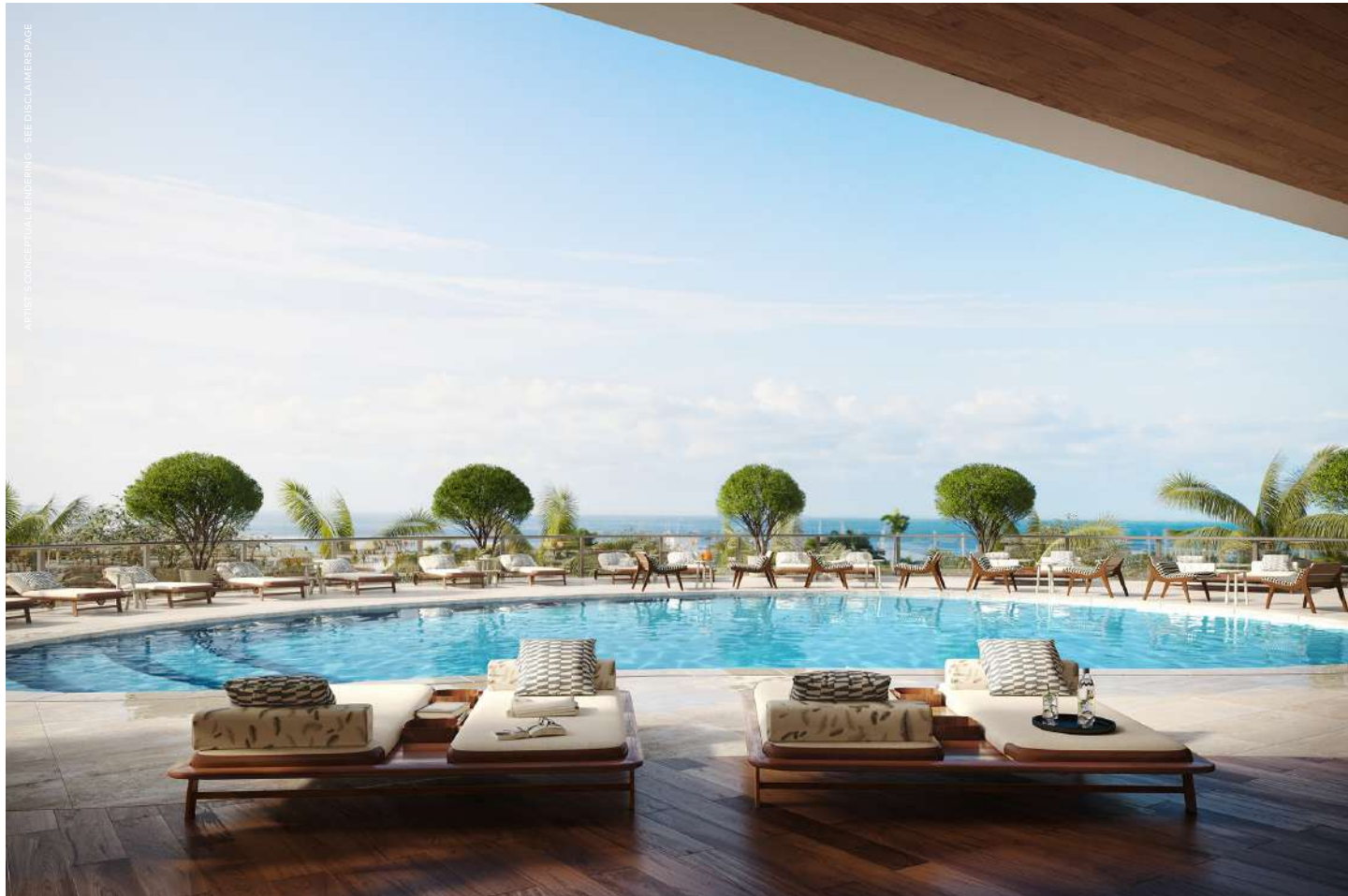
Bayshore Club Pool Deck

Personalized services, including a 24-hour concierge, are complemented by a host of amenities at Mr. C Residences Coconut Grove.