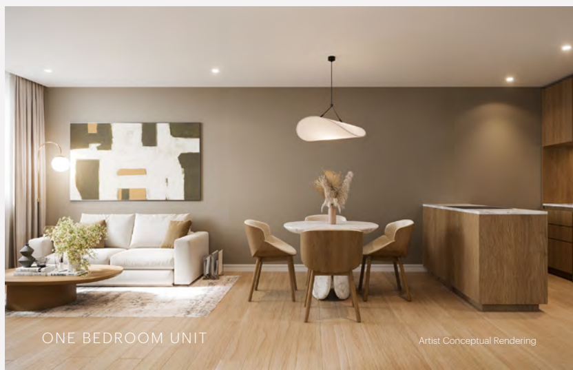
ONE BEDROOM UNIT