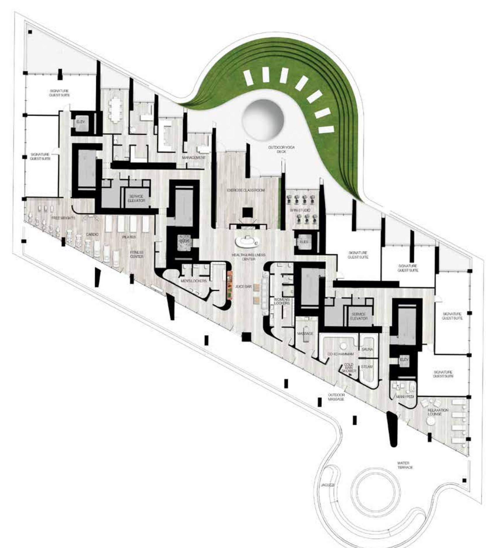
FITNESS & SPA AMENITY LEVEL