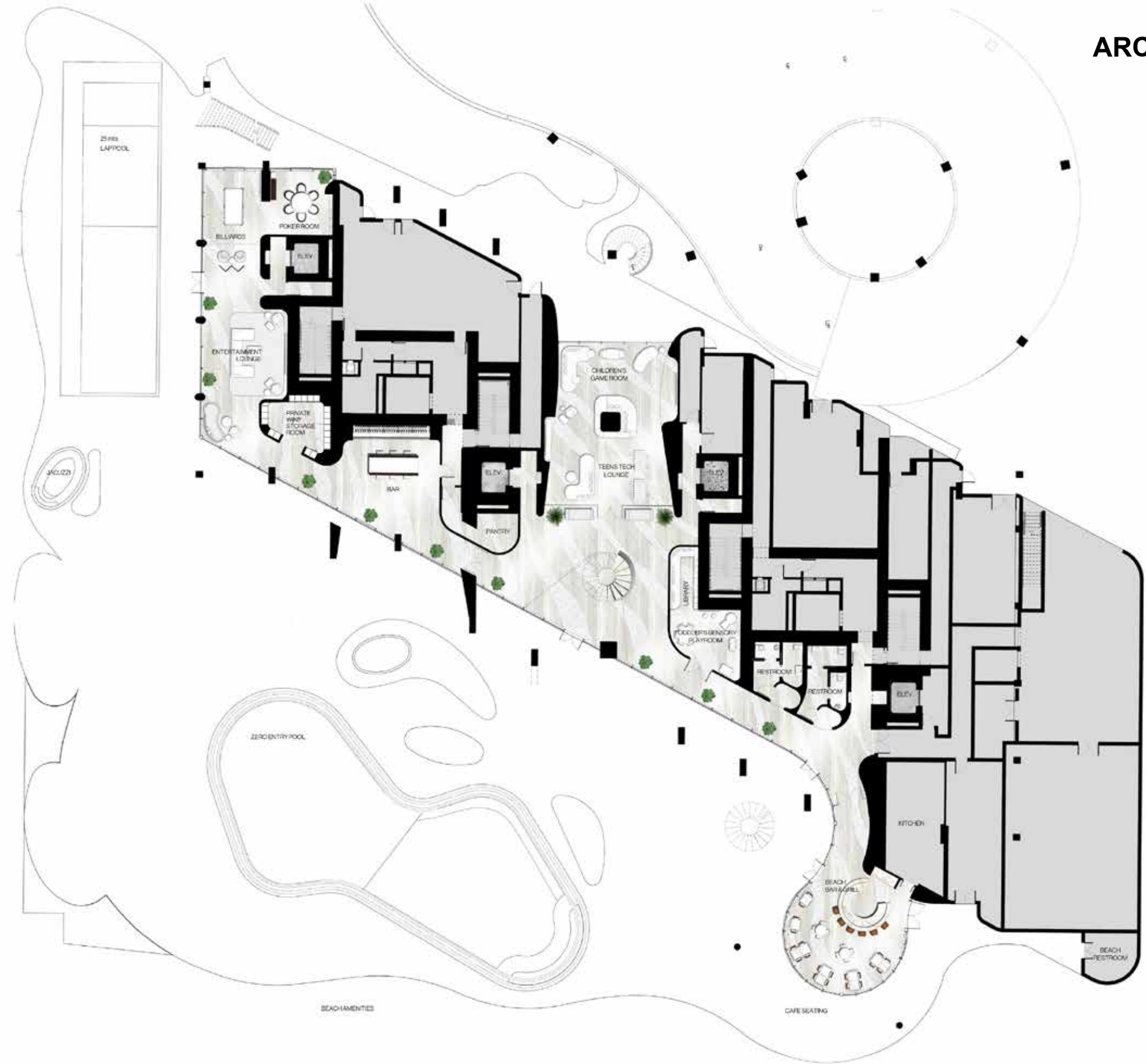
GROUND AMENITY LEVEL