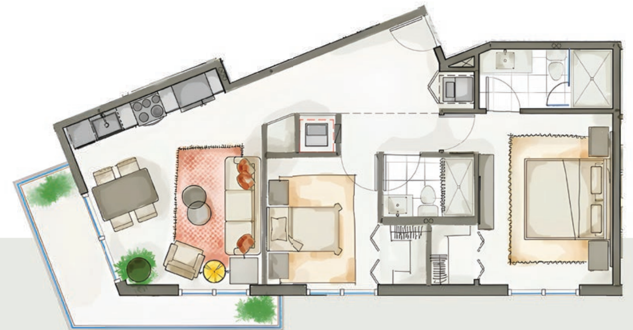
Decoration Simulation of the 2 Bedroom Unit with 907 Sqft / Terrace: 111 Sqft