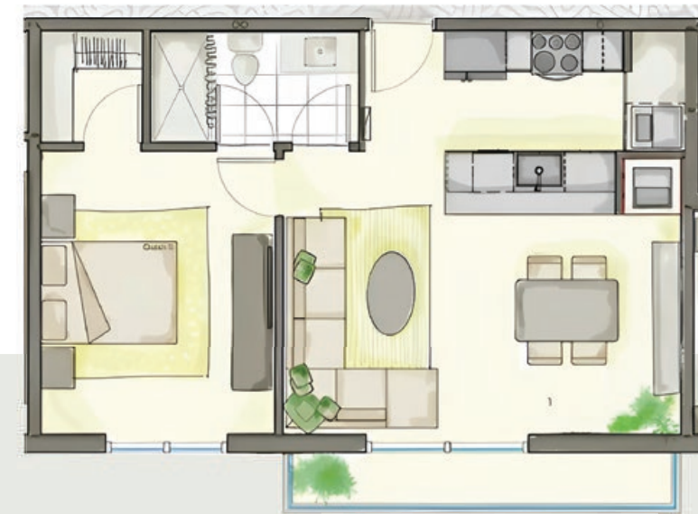
Decoration Simulation of the 1 Bedroom Unit with 685 Sq Ft / Terrace 58 Sq Ft

For those seeking more room to live and work, the one-bedroom apartments at Canal by IQ provide the perfect blend of privacy and comfort. With luxurious finishes and smart home features, each one-bedroom apartment offers a sophisticated living experience that enhances your work-life balance, with plenty of space for relaxation and productivity.