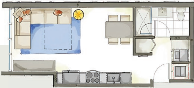
Decoration Simulation of the Studio Unit with 474 Sqft

The ideal configuration for young professionals, the studio apartments deliver a minimalist yet fertile space, combined with services that meet the needs of an active lifestyle. — Designed for the modern professional, our studio apartments offer sleek, minimalist living without compromising on luxury. Ideal for those with active lifestyles, the studio layouts allow for creative use of space, making them perfect for remote workers or as a stylish pied-à-terre.