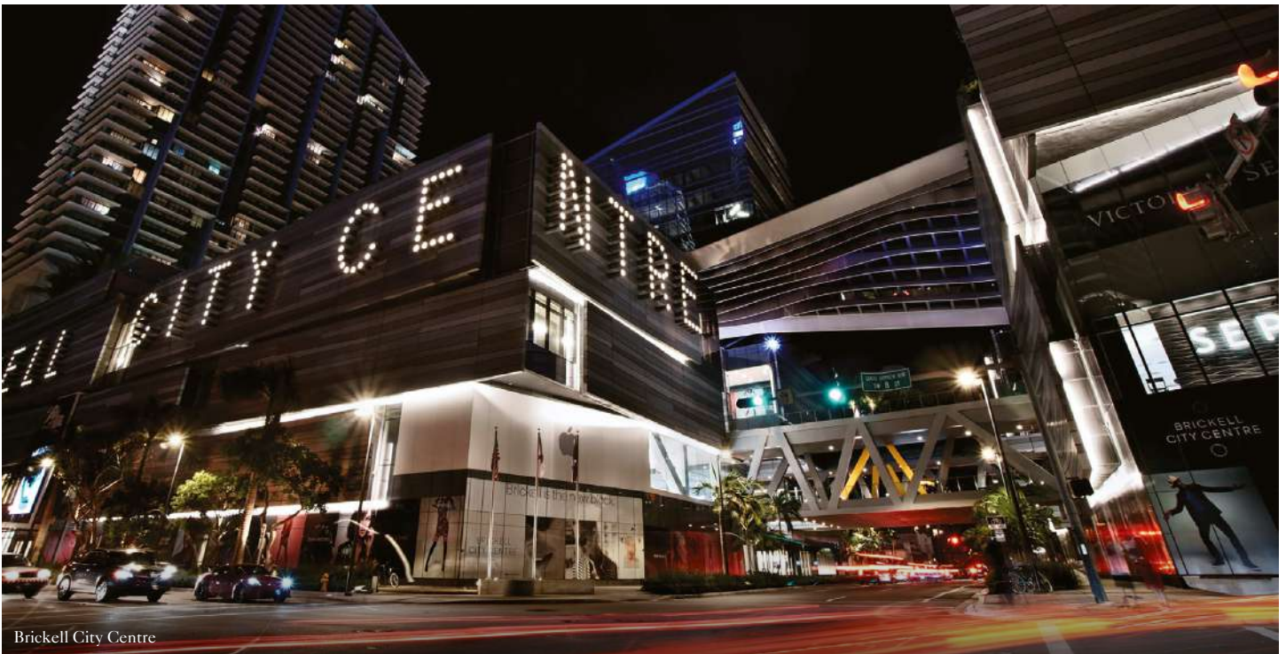
Brickell City Centre

Perfectly positioned at the entrance of Brickell Avenue, where the Miami River meets the beautiful blue waters of Biscayne Bay, and the bustling financial district blends with high-end shopping, top restaurants, cultural hot spots and exiting nightlife – this iconic neighborhood is an all-day all-night lifestyle destination, aptly named the Manhattan of the South.