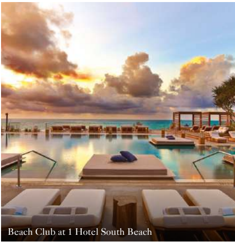
Beach Club at 1 Hotel South Beach

The private marina, planned riverside restaurant and lushly landscaped river promenade invite residents to spend hours and days luxuriating in the infinite energy and organic sparkle of life by the water. Watch the superyachts come and go, take a sunset stroll towards the bay, or head to a number of chic waterside restaurants courtesy of our private water taxi service. Residents can enjoy private membership and exclusive access to the Beach Club at 1 Hotel South Beach, SH Hotels & Resorts sister property. With loungers, beach towel services, cabanas, and seaside snack and beverage services, this waterfront community will cater to leisurely hours under the sun. Take a break from the hustle and bustle of the city and unwind with a cool drink in hand and the sand between your toes.