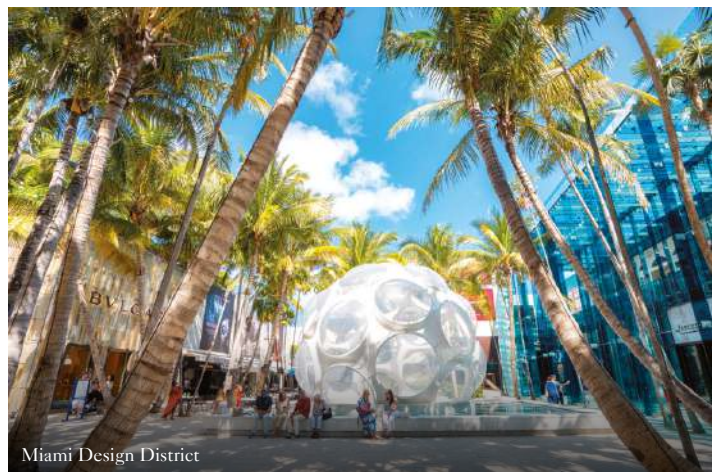
Miami Design District