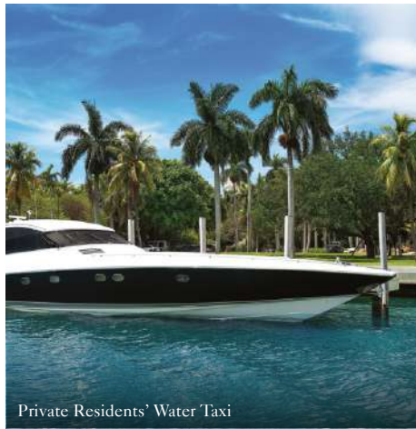
Private Residents' Water Taxi