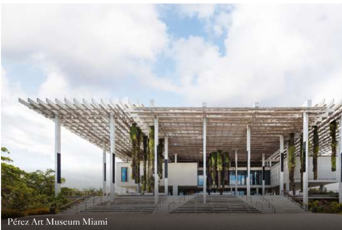
Pérez Art Museum Miami