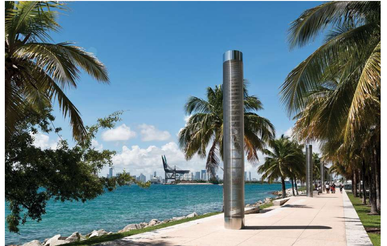
South Pointe Park