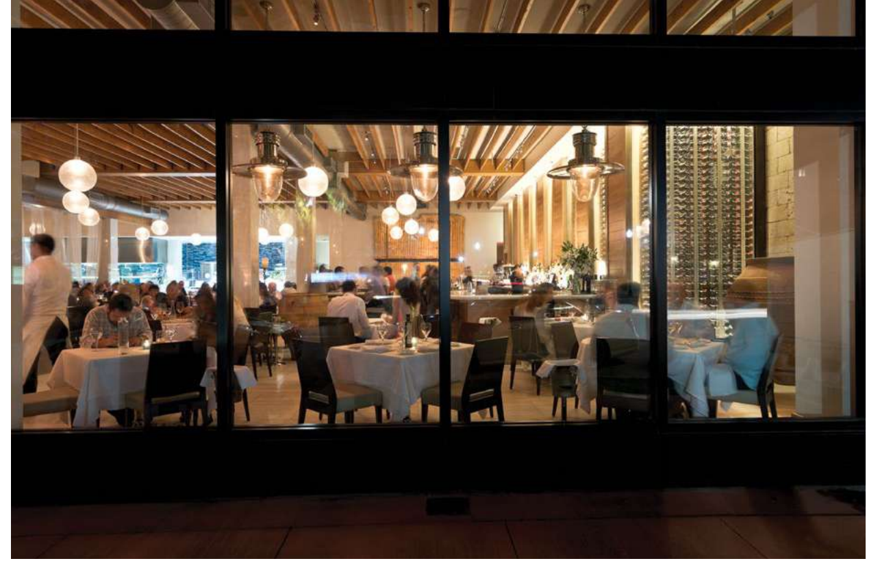
Estiatorio Milos by Costas Spiliadis