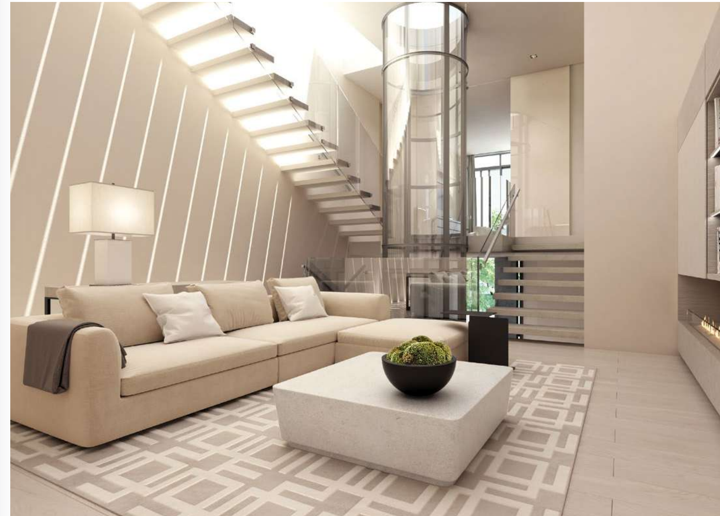
Foyer, First Level

"The uncompromised vision is about creating an experience through which the lifestyle itself is elevated to an art form. Edited color, texture, and form all go beyond the essence of design in pursuit of a comfortable and provocatively luxurious lifestyle." – Charles Allem, Designer