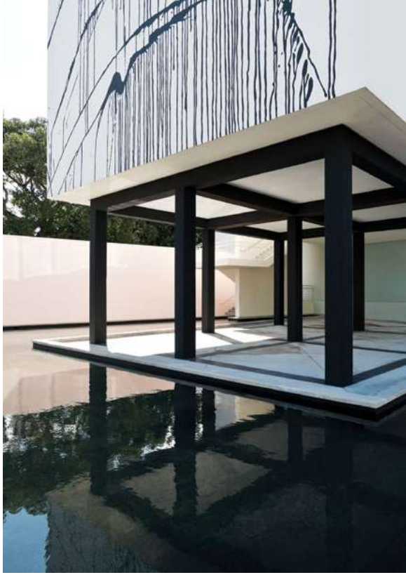
The Bass Museum of Art