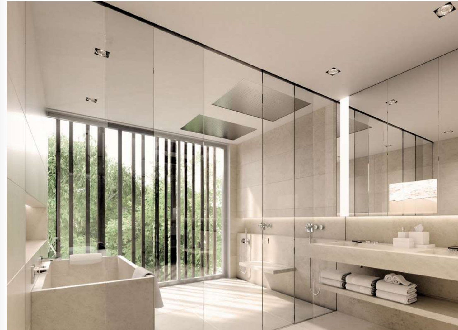
Master Suite, Second Level

Precision-cut Italian tiles effortlessly merge with Pibamarmi marble tub and pedestal vanities, dual rain showers, Dornbracht fixtures and Duravit toilets.