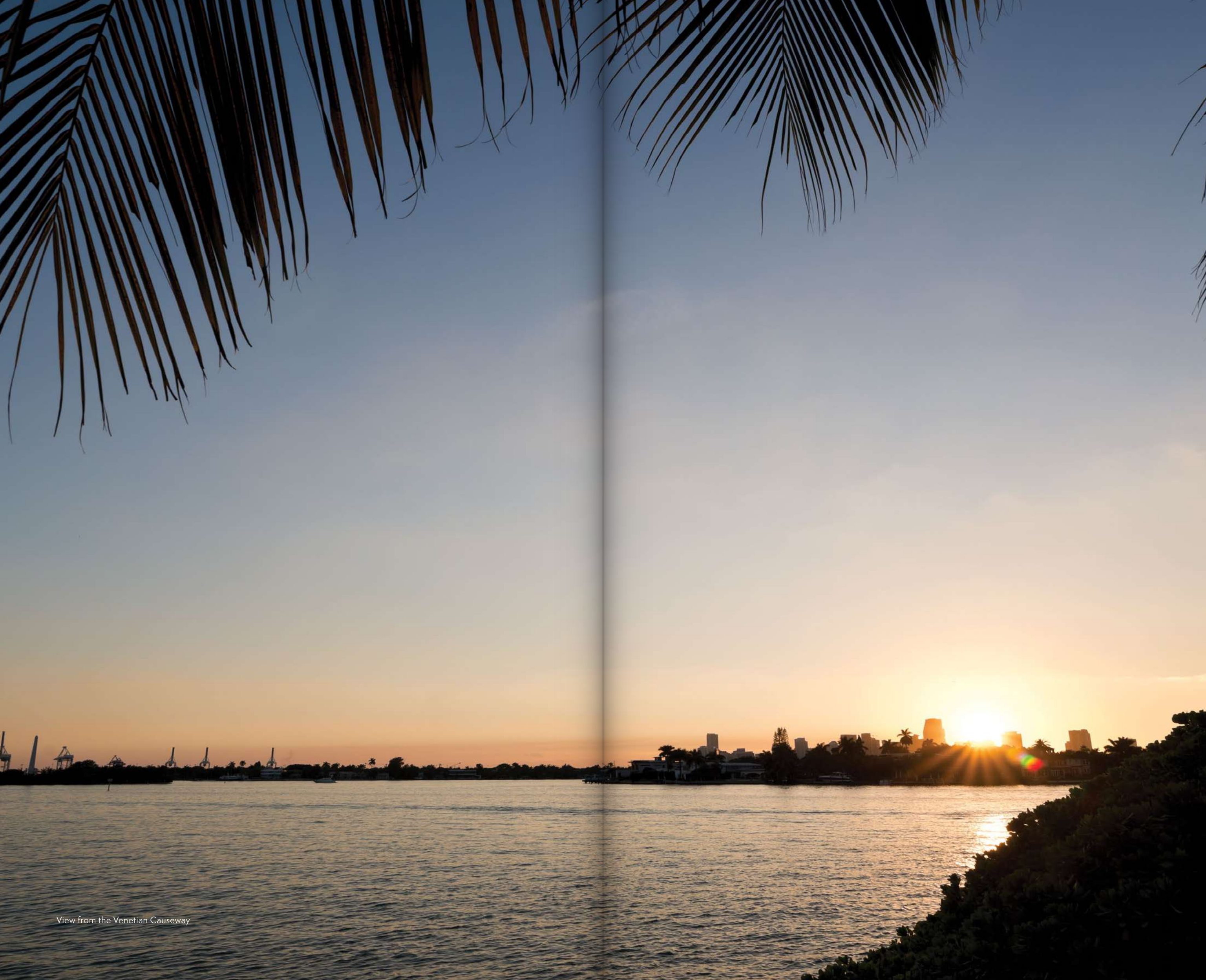
View from the Venetian Causeway